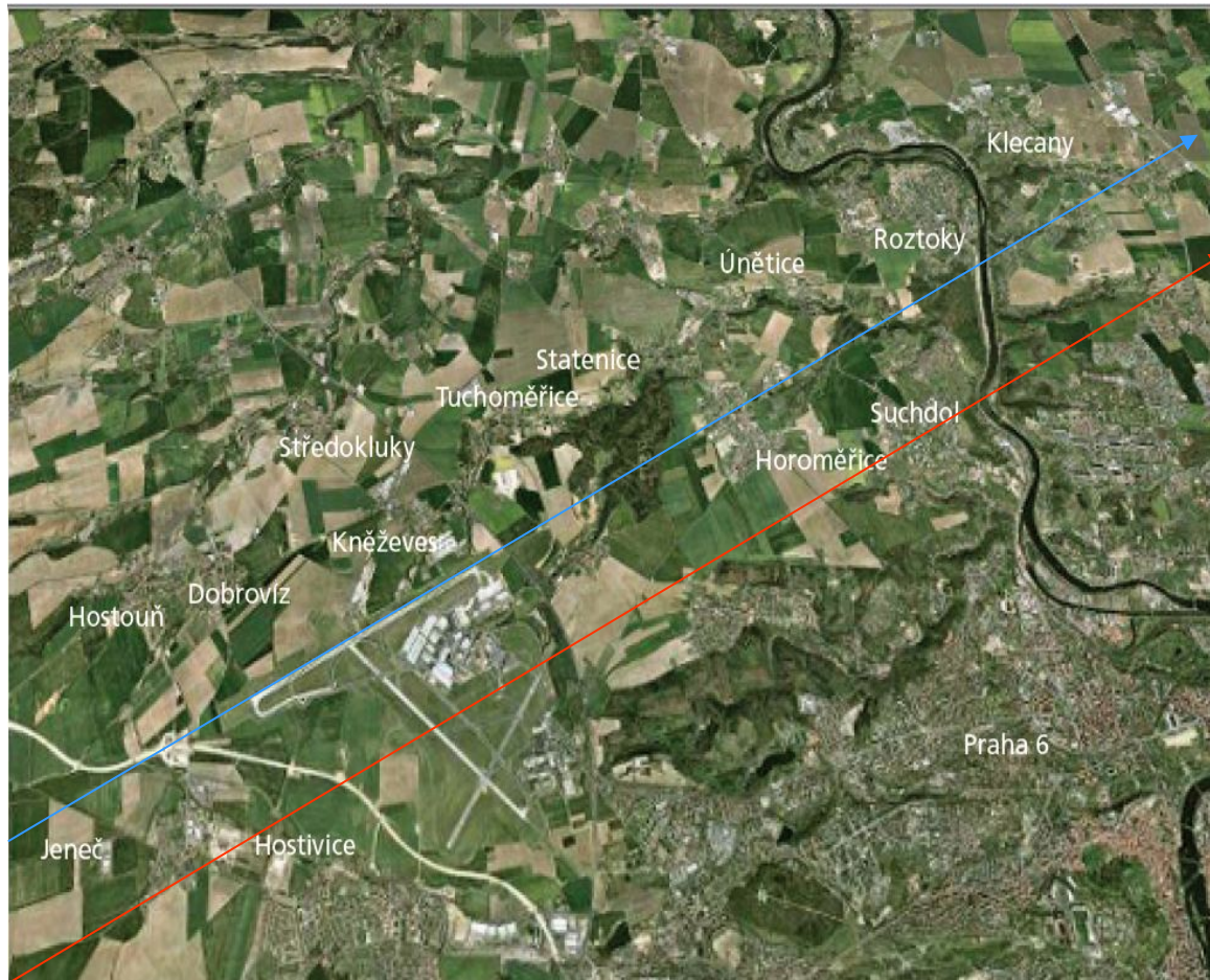
Prague Airport Region – PAR