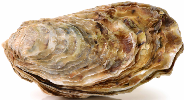
Oyster // Arcachon